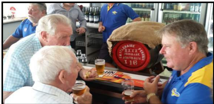
Plenty of stories at the old boys Function in May

A special thanks to the guidance and leadership of those who have served the club in previous years.