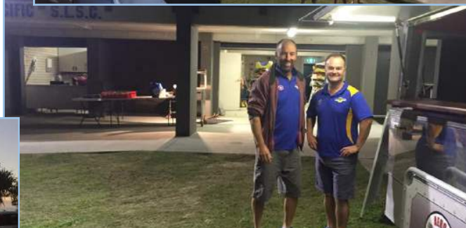
The Burger Boys getting ready to BBQ