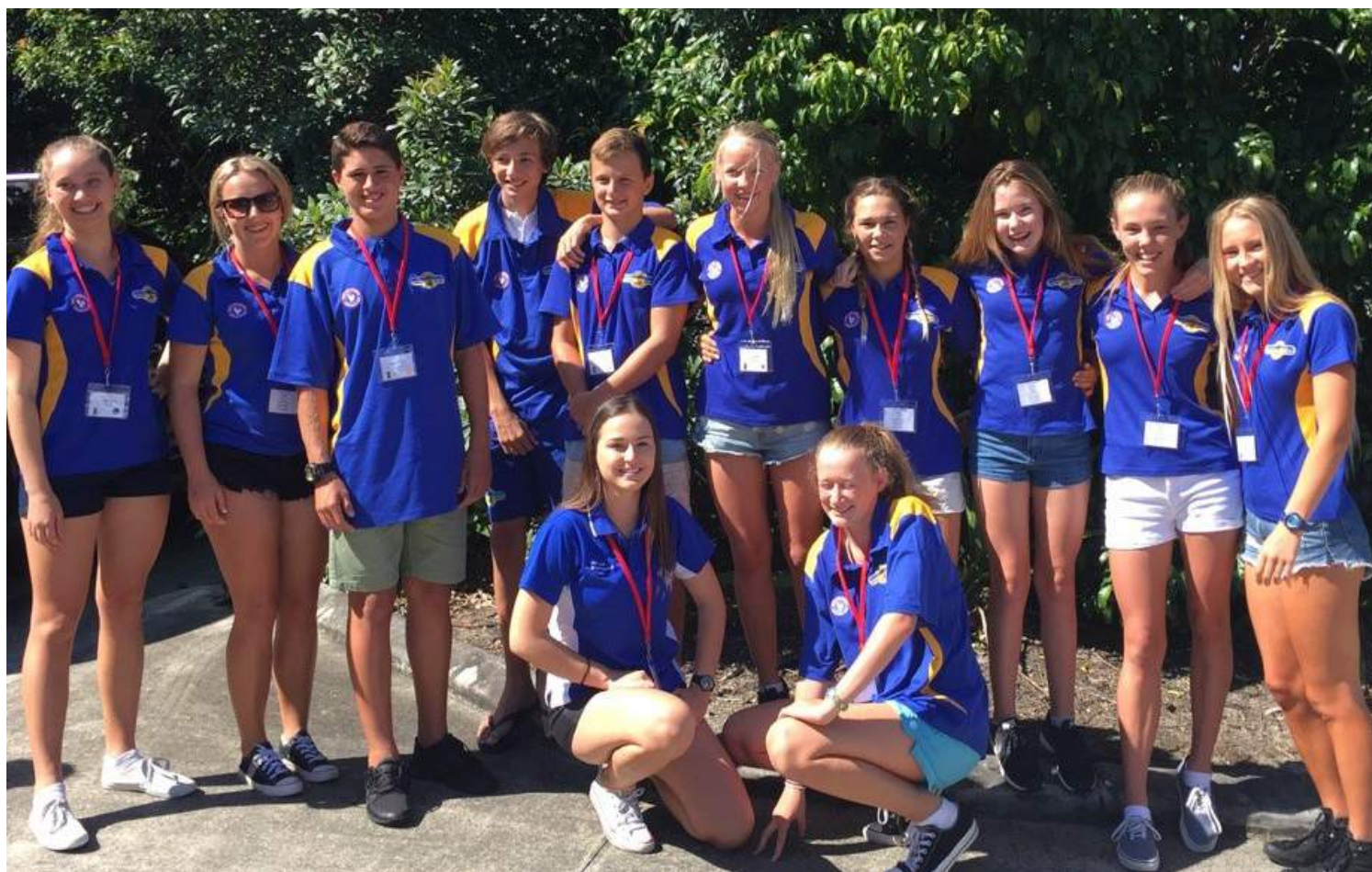
Strong representation from Pacific with nine participants and three leaders at the recent Surf Soldiers Camp.